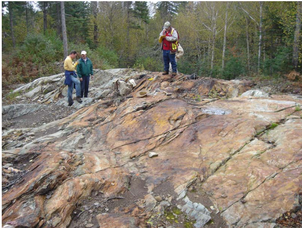
Figure 4: MFLZ Outcrop, October 2009. Geologists for scale.