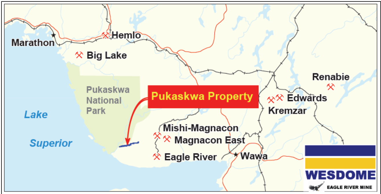
Figure 1: Pukaskwa Location Map